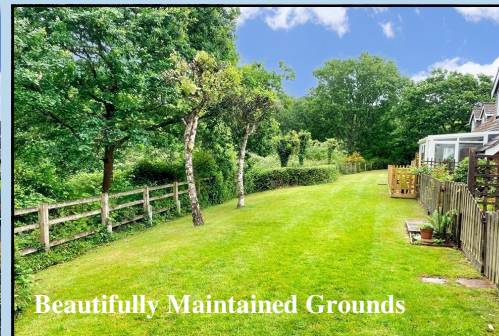
Beautifully Maintained Grounds