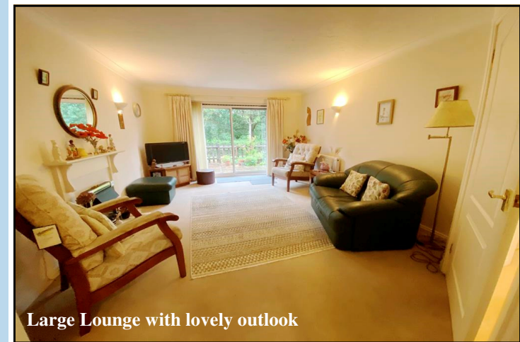
Large Lounge with lovely outlook