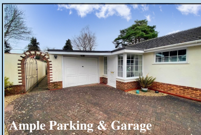
Ample Parking & Garage

IMPORTANT NOTE: These particulars are believed to be correct but their accuracy is not guaranteed. They do not form part of any contract. Nothing in these particulars shall be deemed to be a statement that the property is in good structural condition or otherwise, nor that any of the services, appliances, equipment or facilities are in good working order or have been tested. Purchasers should satisfy themselves on such matters prior to purchase.