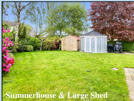
Summerhouse & Large Shed