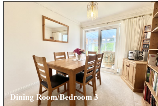
Dining Room/Bedroom 3