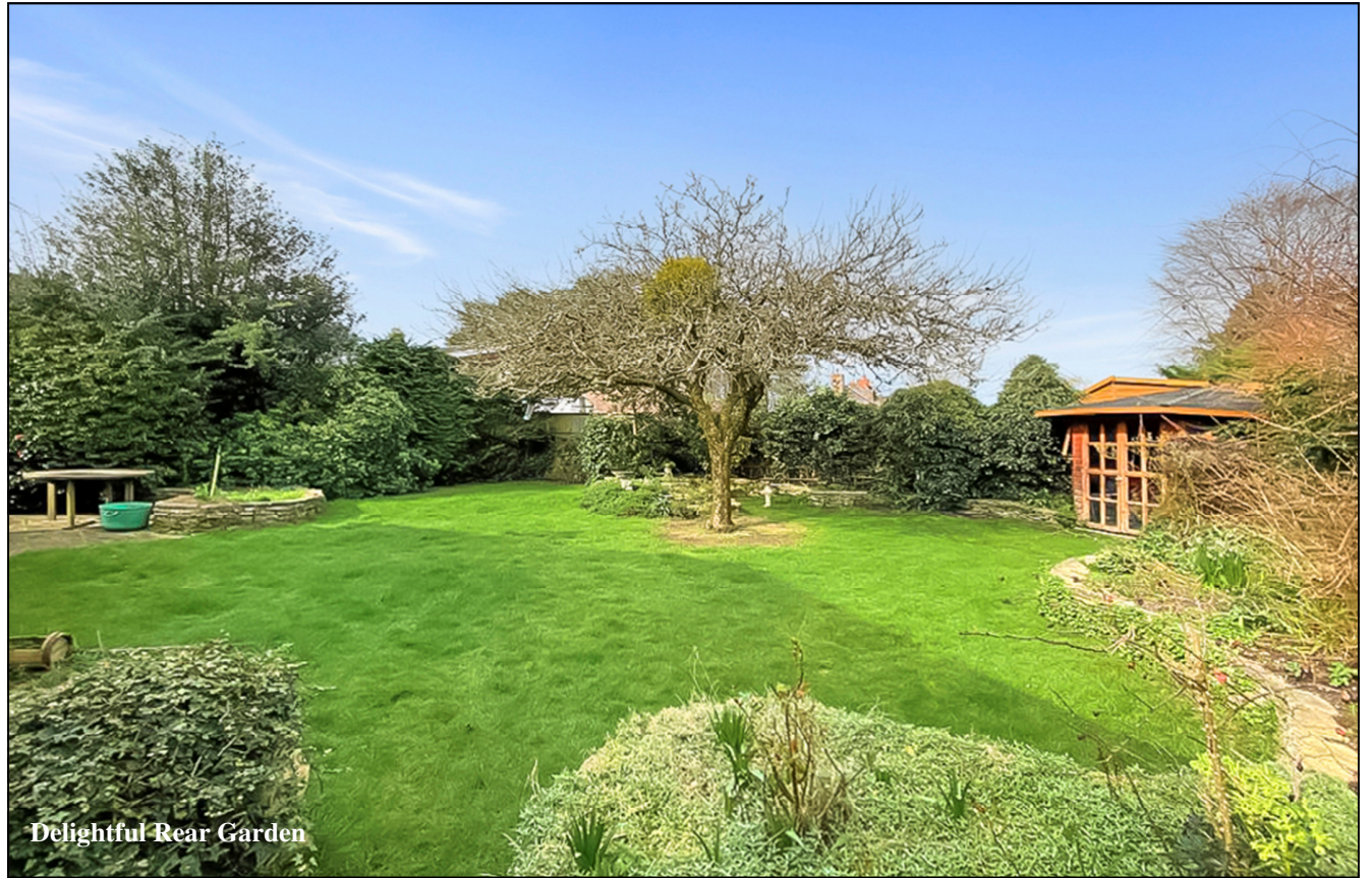
Delightful Rear Garden