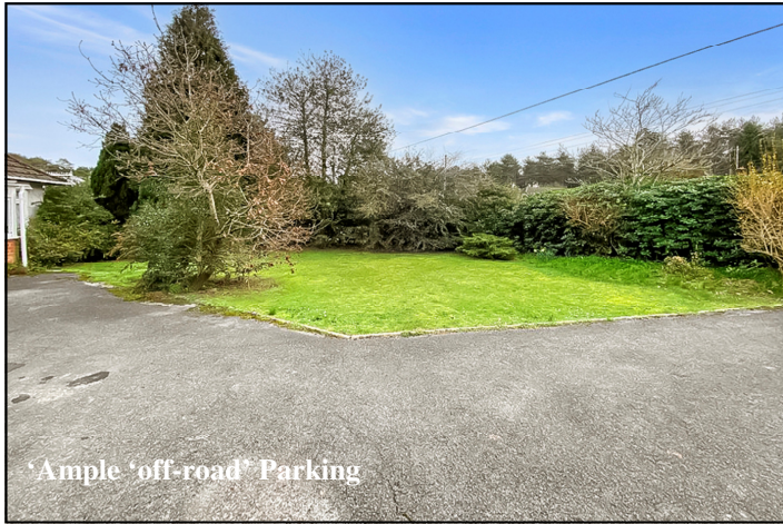
Ample 'off-road' Parking