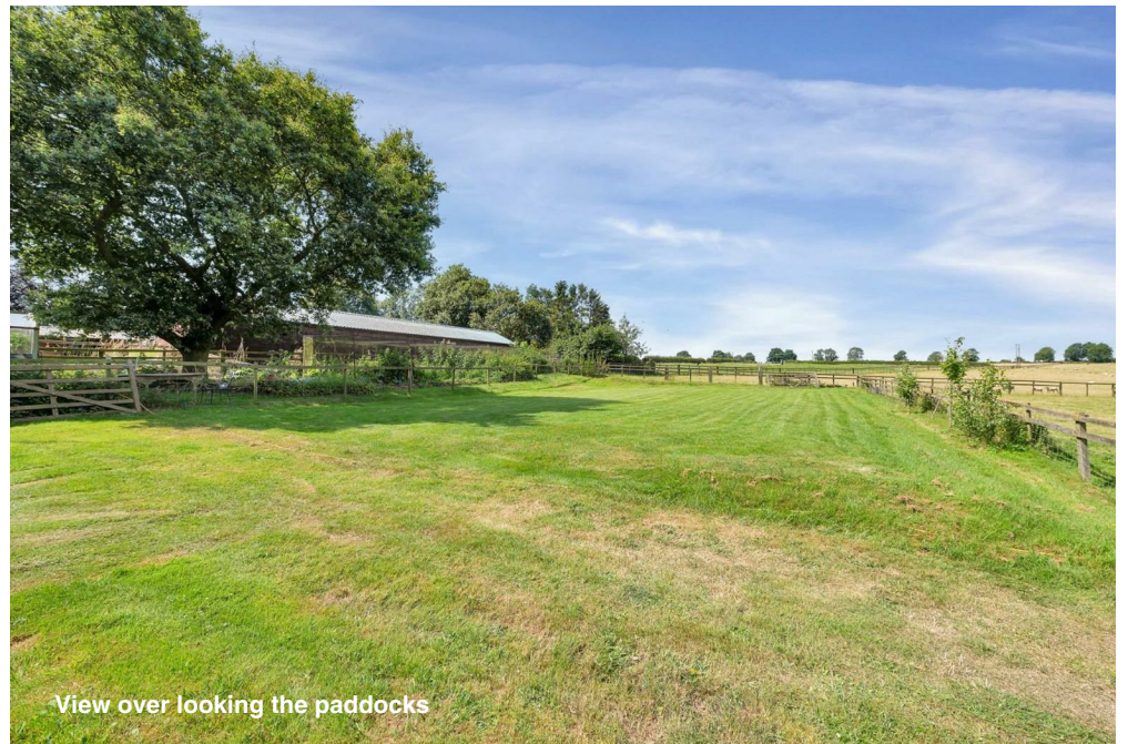
View over looking the paddocks