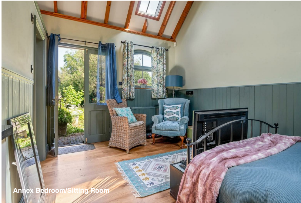
Annex Bedroom/Sitting Room