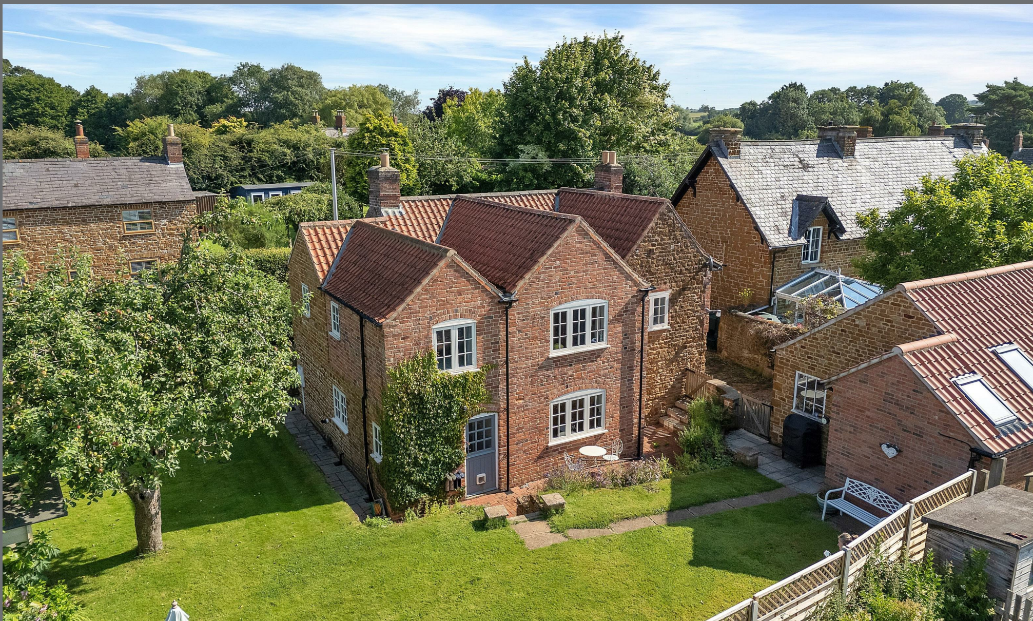
The Old Post Office, 29 Main Street, Goadby Marwood, LE14 4LN Guide Price £625,000