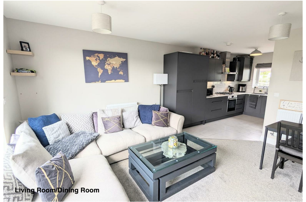
Living Room/Dining Room