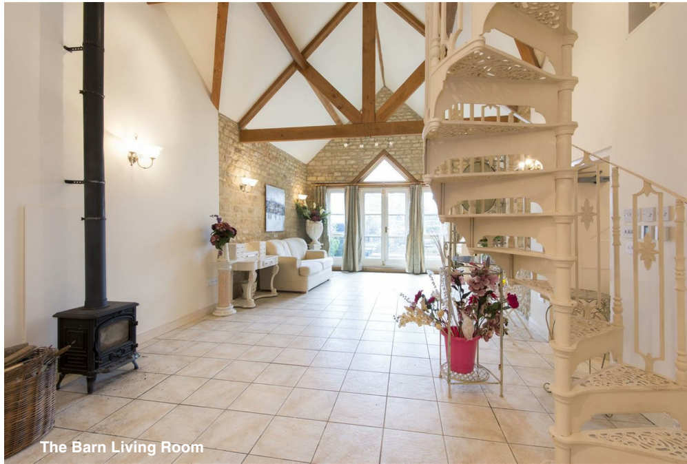
The Barn Living Room