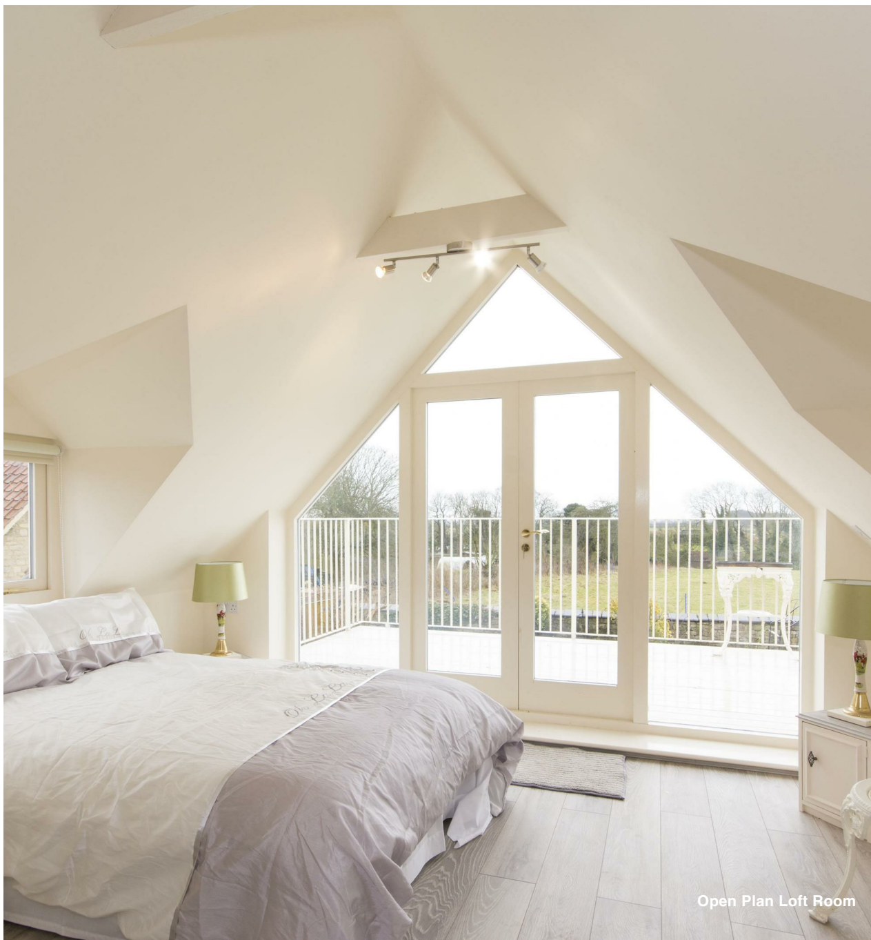
Open Plan Loft Room