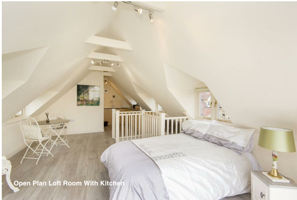
Open Plan Loft Room With Kitchen