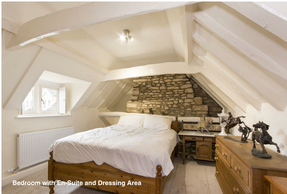
Bedroom with En-Suite and Dressing Area