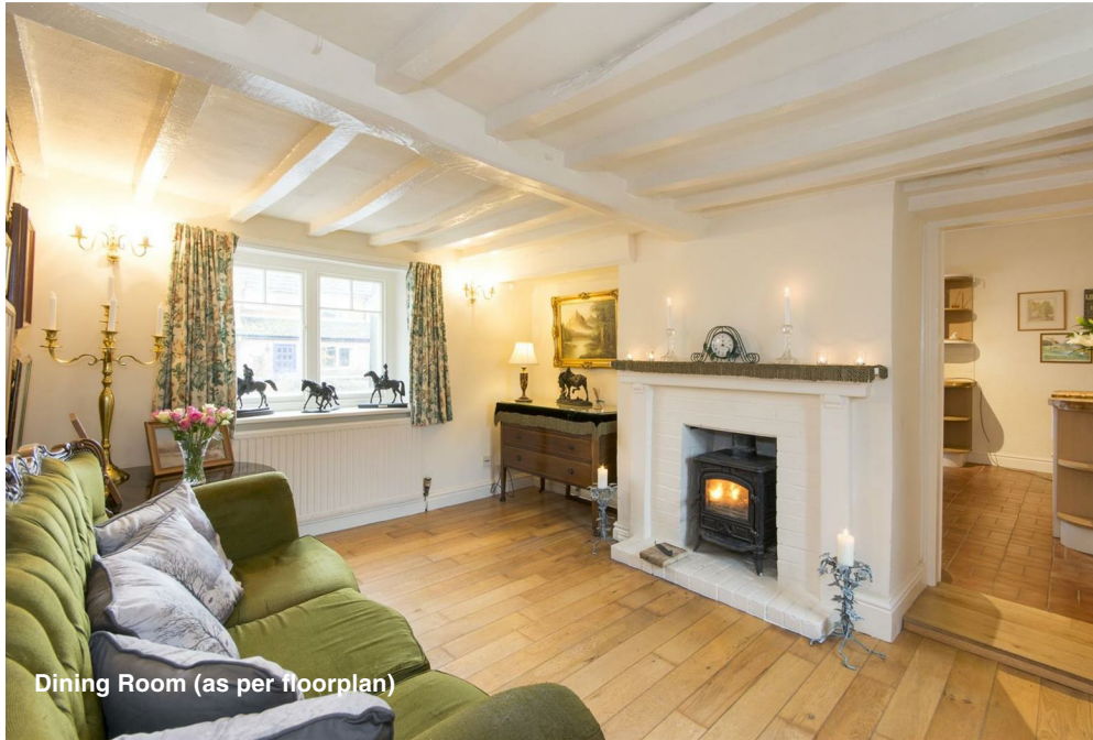
Dining Room (as per floorplan)