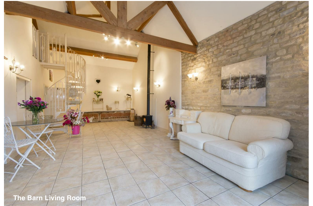
The Barn Living Room