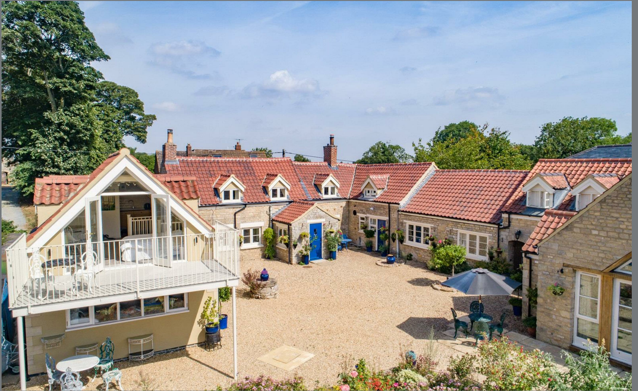
The Old Blue Dog, Stainby