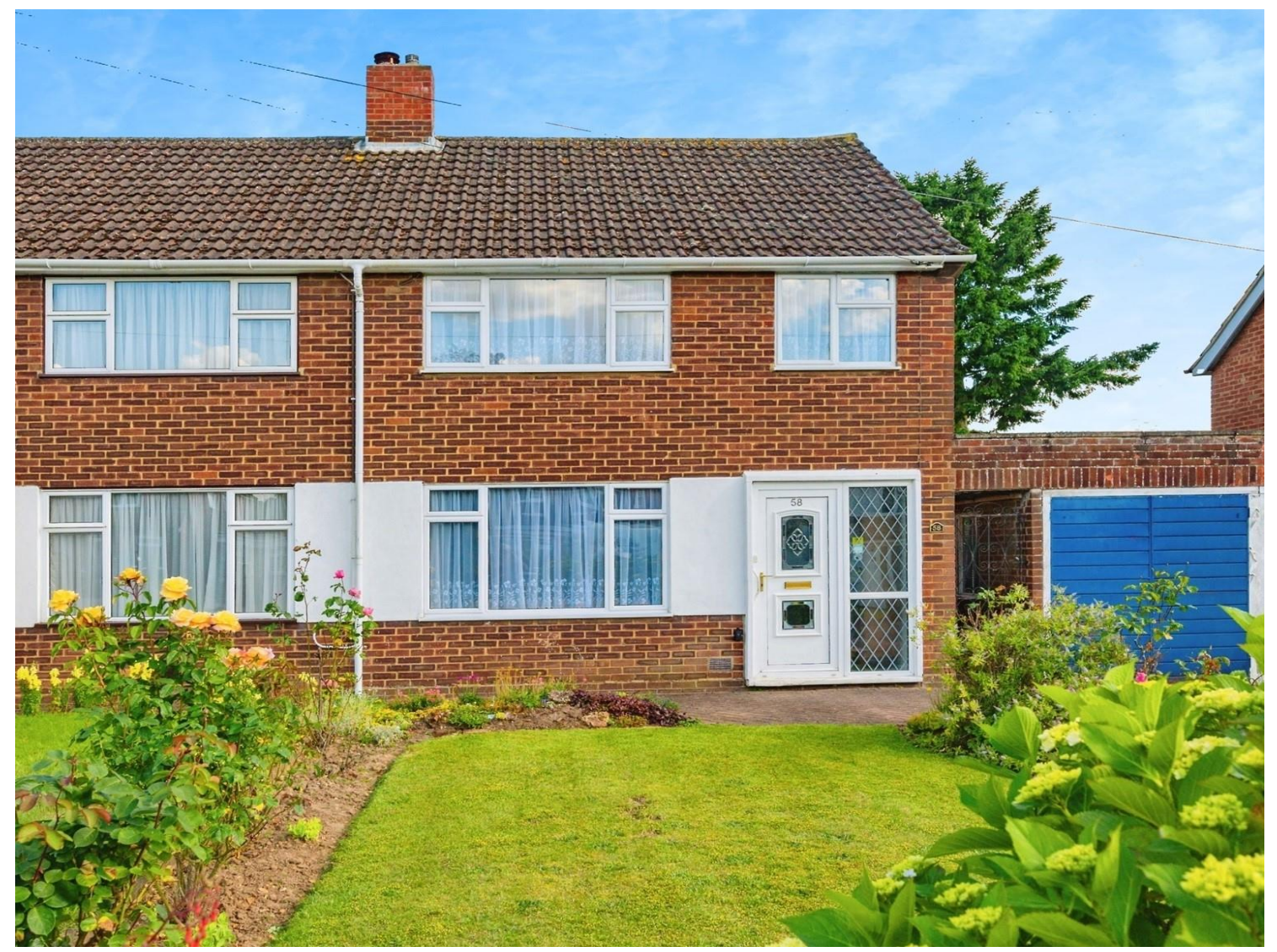
Morris Way London Colney St. Albans AL2 1JN