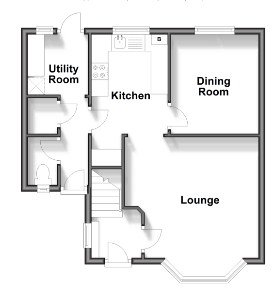
First Floor Approx. 33.3 sq. metres (358.6 sq. feet)

Approx. 42.2 sq. metres (454.5 sq. feet)