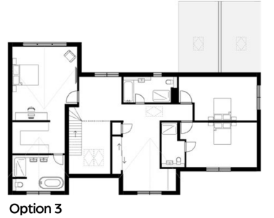
3 bedrooms with option to have an open plan snug or working space.