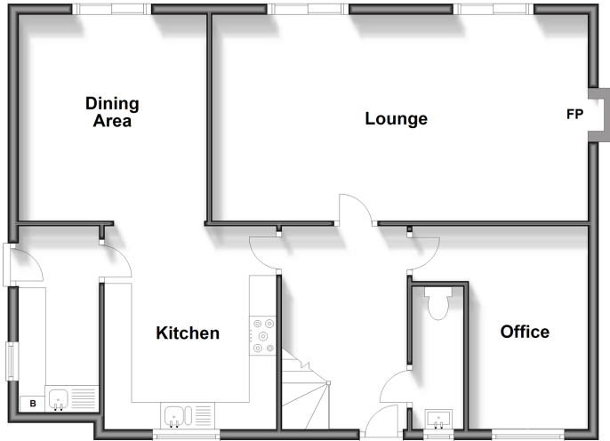
Ground Floor Approx. 80.6 sq. metres (867.3 sq. feet)