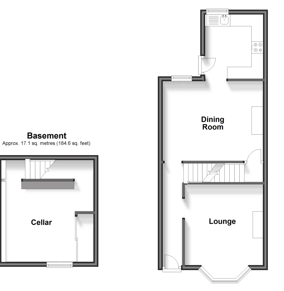
Approx. 41.0 sq. metres (441.5 sq. feet)