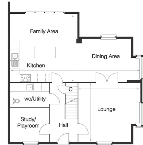
The Codrington Ground Floor