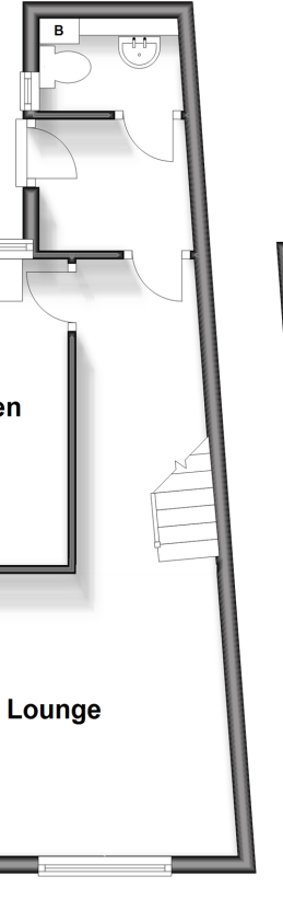
First Floor Approx. 40.0 sq. metres (430.8 sq. feet)