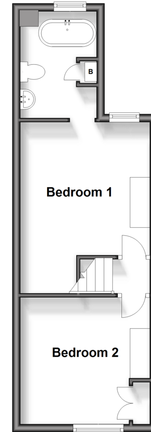
Split Level First Floor Approx. 29.8 sq. metres (320.7 sq. feet)