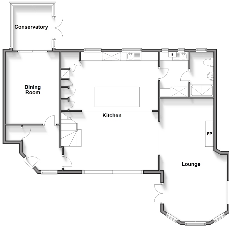
First Floor Approx. 77.6 sq. metres (835.1 sq. feet)