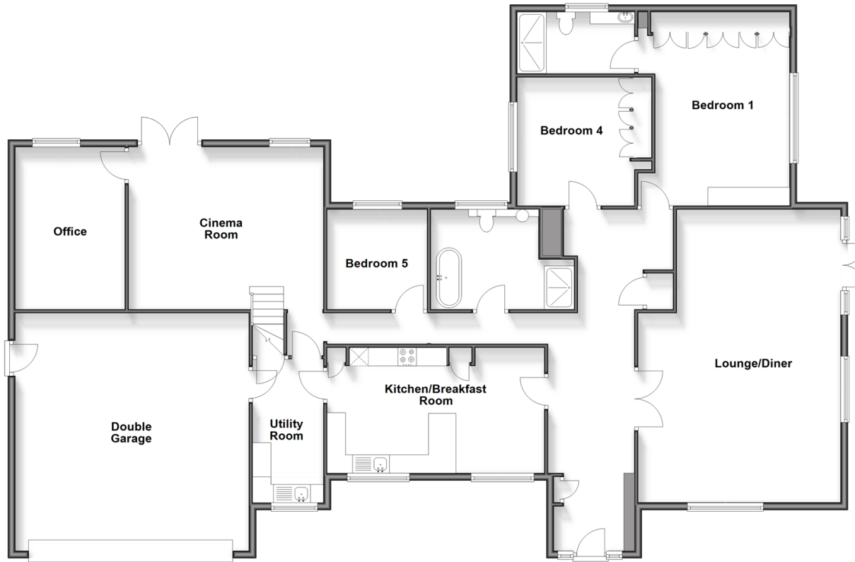
Ground Floor Approx. 236.5 sq. metres (2545.6 sq. feet)