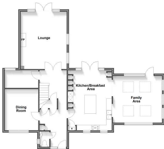
Ground Floor Approx. 102.6 sq. metres (1104.8 sq. feet)