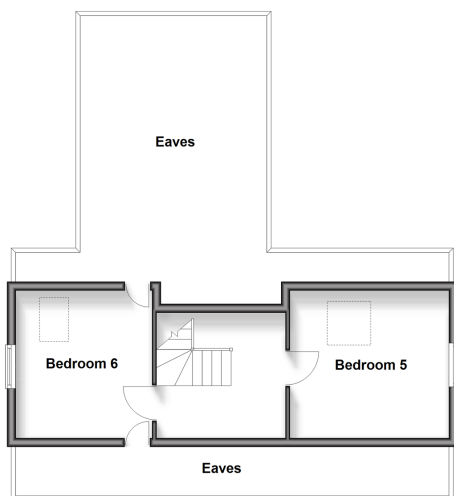
Second Floor Approx. 32.0 sq. metres (344.0 sq. feet)