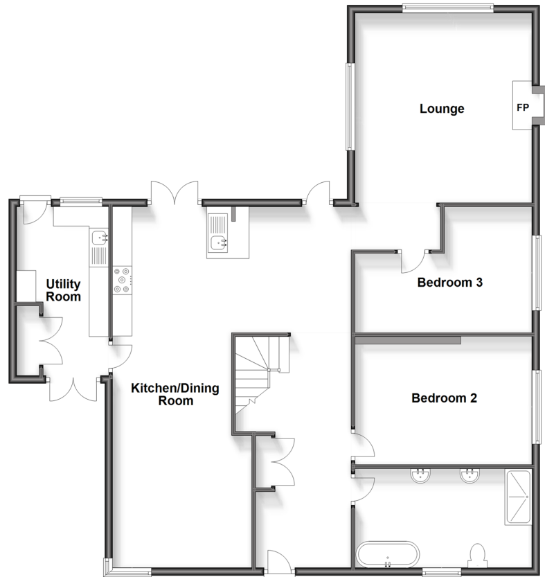
Ground Floor Approx. 131.6 sq. metres (1417.0 sq. feet)