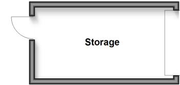
Outbuilding Approx. 11.9 sq. metres (127.6 sq. feet)