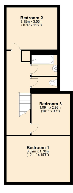
Total area: approx. 111.5 sq. metres (1200.5 sq. feet)