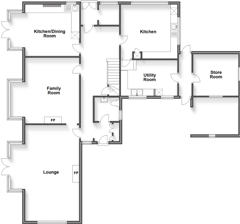
Ground Floor Approx. 151.2 sq. metres (1627.4 sq. feet)