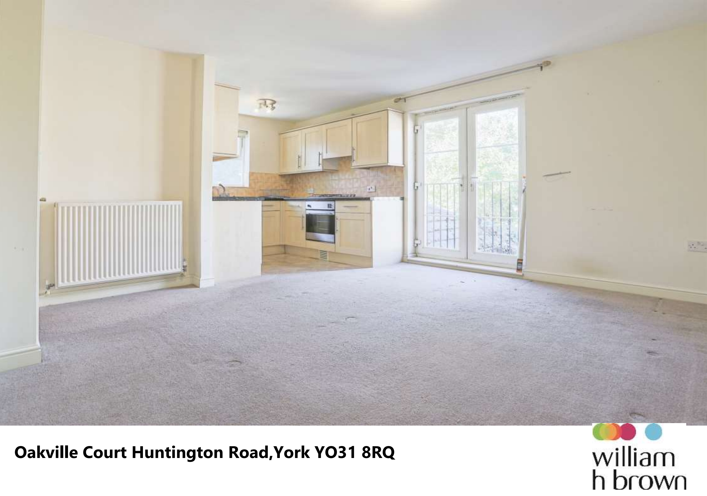
Oakville Court Huntington Road, York YO31 8RQ