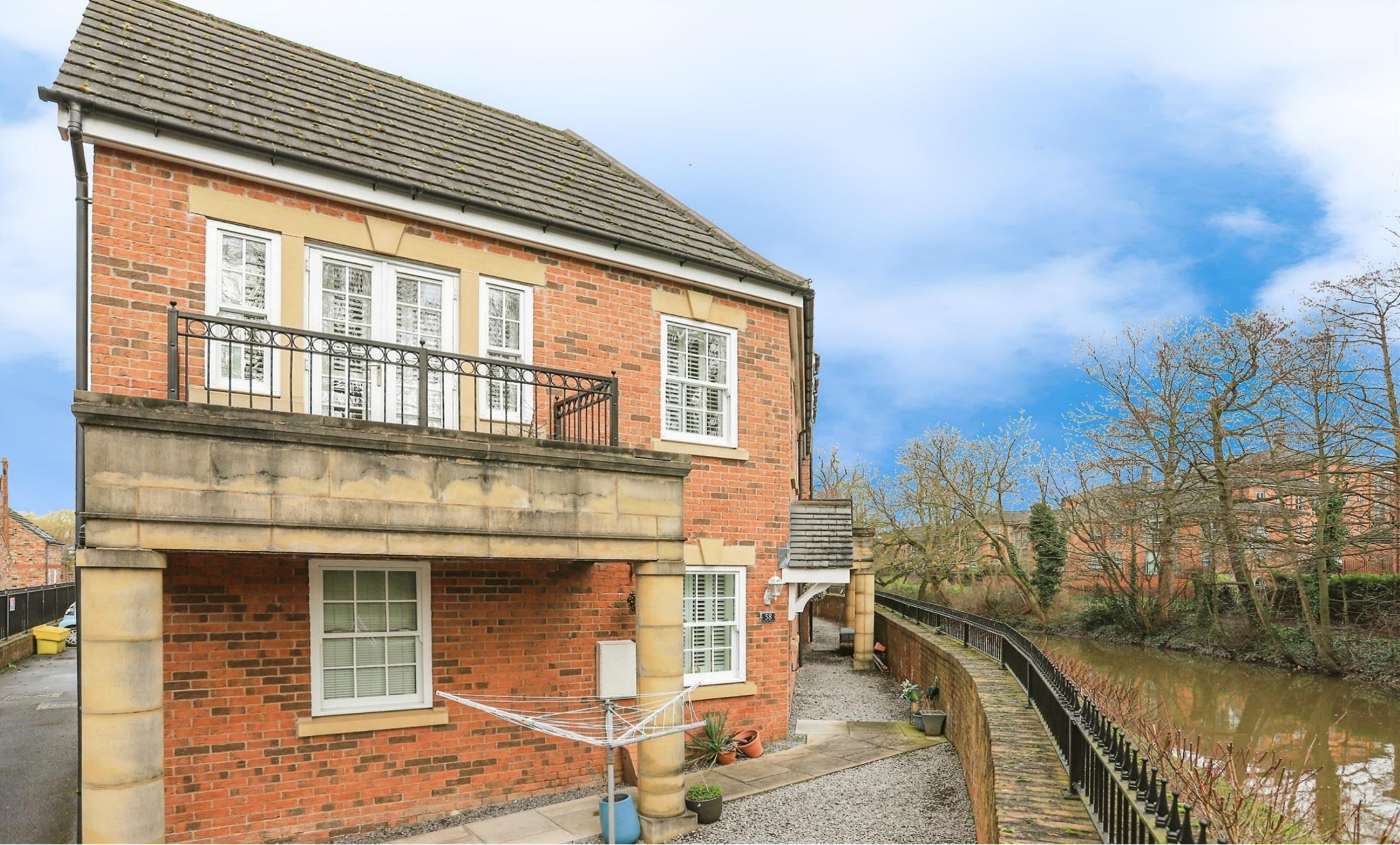
Islands House Dennison Street, York YO31 8YX