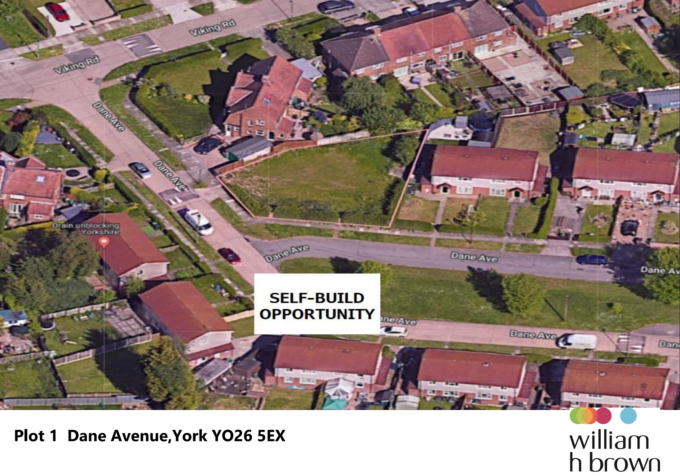
Plot 1 Dane Avenue, York YO26 5EX