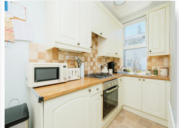
North Street, Rawdon Leeds LS19 6JE