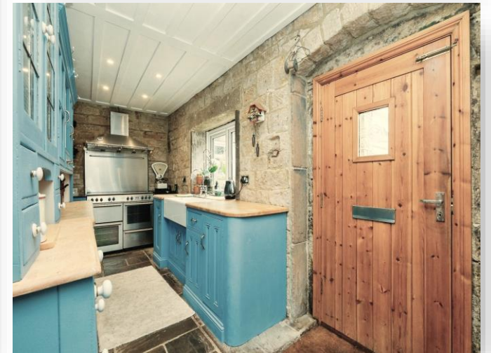
Moor View, Yeadon Leeds LS19 7AX