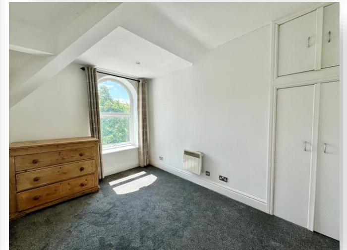
High Street, Yeadon Leeds LS19 7PP