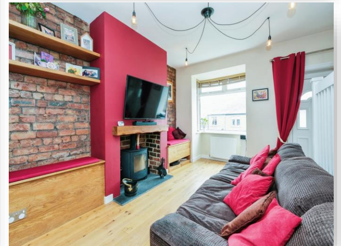
Wentworth Terrace, Rawdon Leeds LS19 6PT