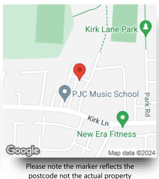
view this property online williamhbrown.co.uk/Property/YEA106540