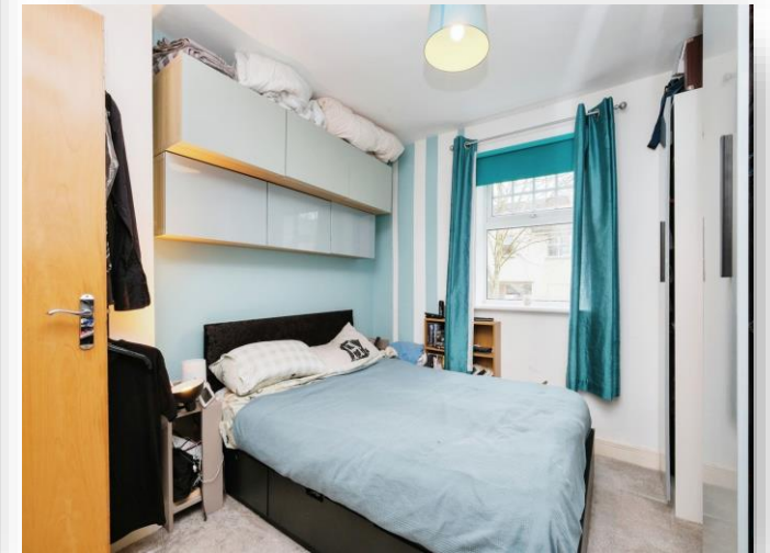
Kingsdale Drive, Menston ILKLEY LS29 6QN