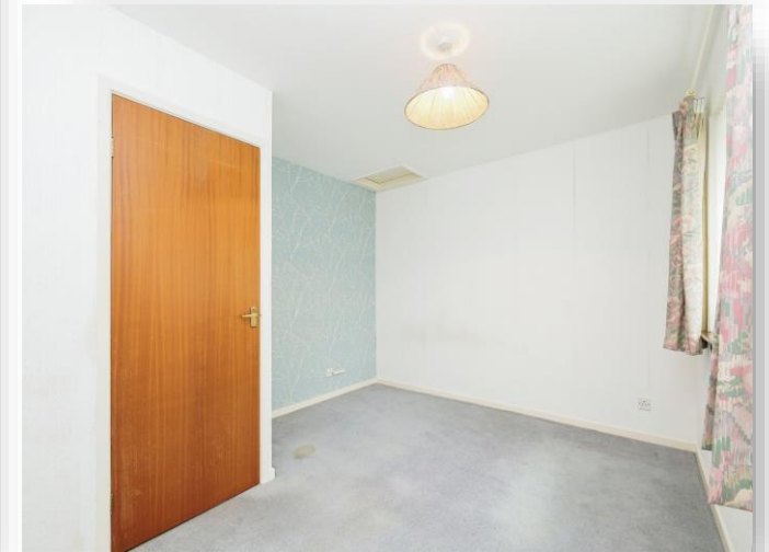
Lakeside Terrace, Rawdon Leeds LS19 6EE