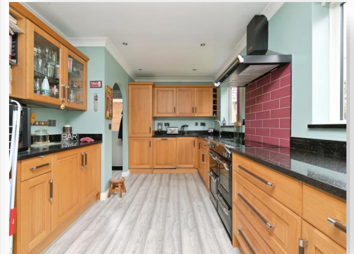
Rolls Close, Yaxley Peterborough PE7 3QT