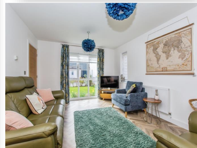
Thompsons Yard, Yaxley Peterborough PE7 3TA