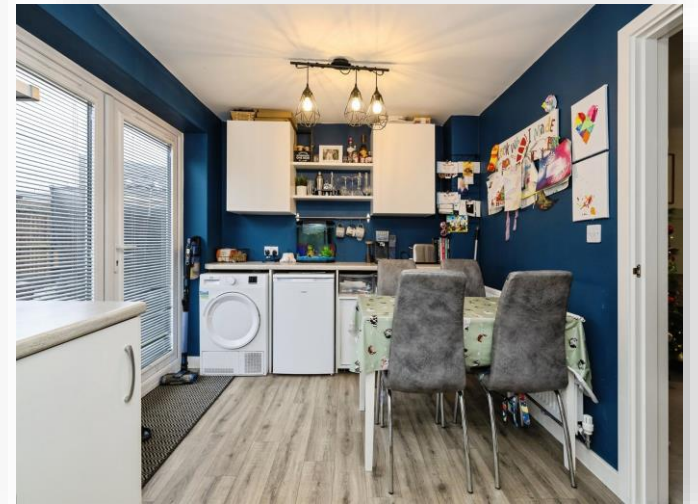
Harmony Grove, Hampton Gardens Peterborough PE7 8QX