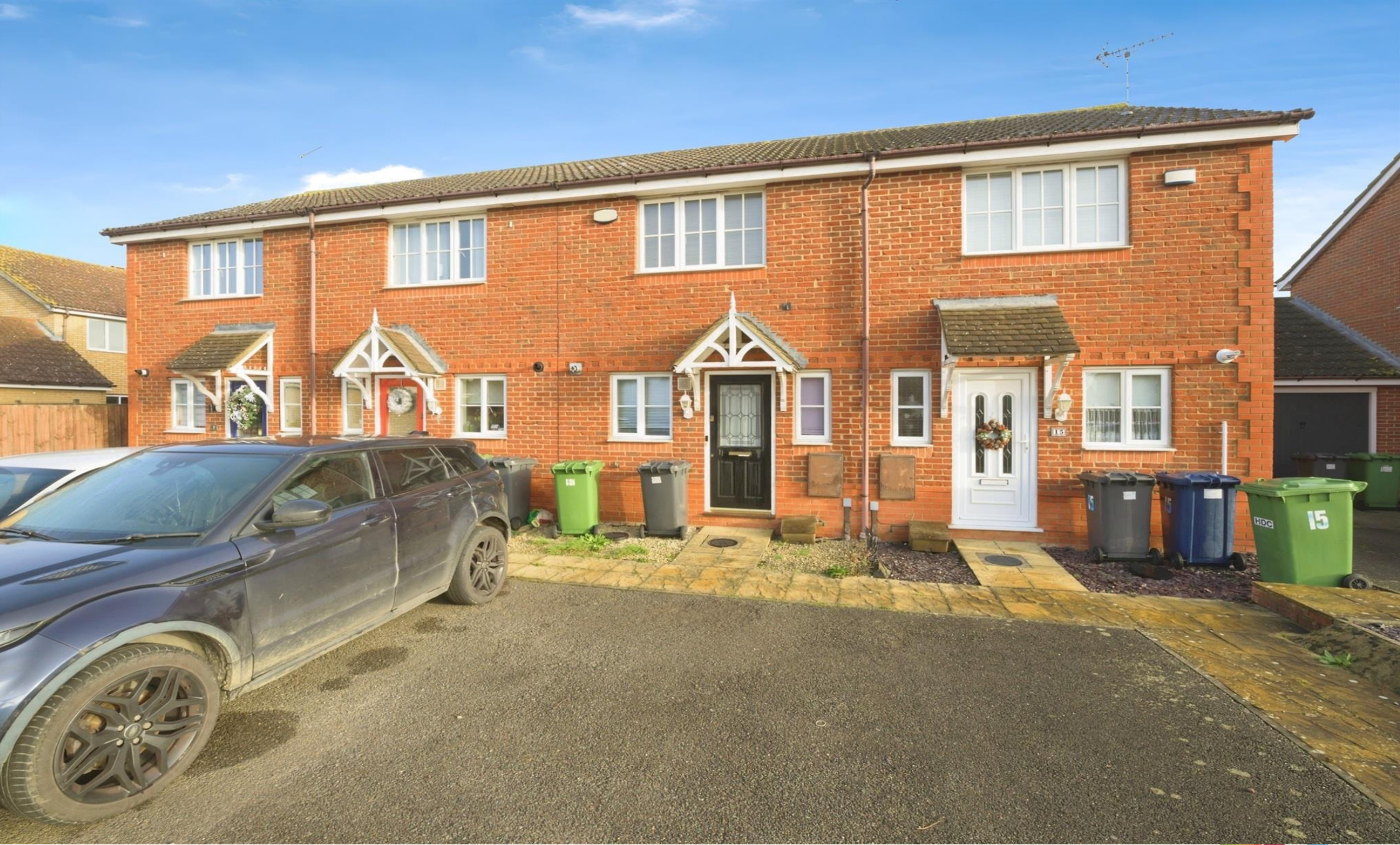
Morris Court, Yaxley Peterborough PE7 3GJ