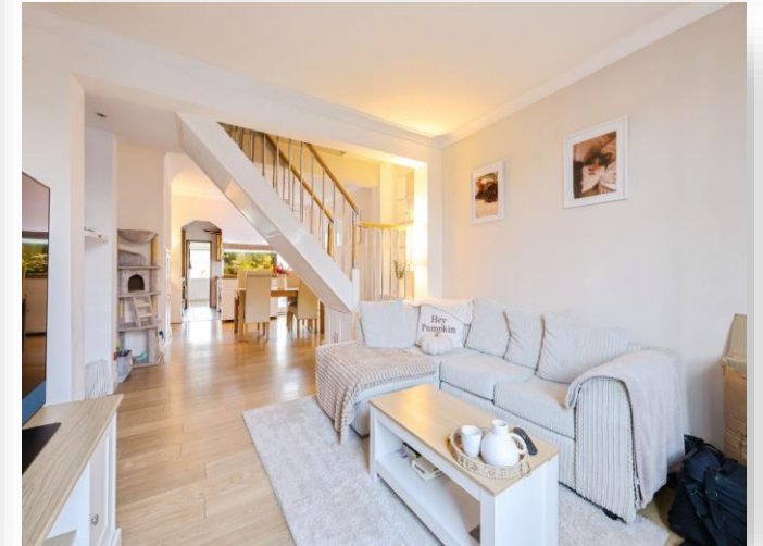
Broadway, Yaxley Peterborough PE7 3JD