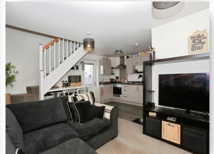
Aqua Drive, Hampton Water Peterborough PE7 8QN