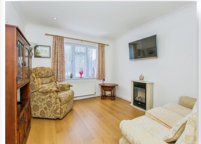
Manor Close, Yaxley Peterborough PE7 3NS