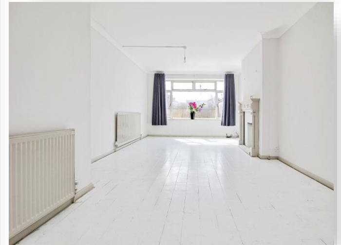
Ashridge Walk, Yaxley Peterborough PE7 3EU