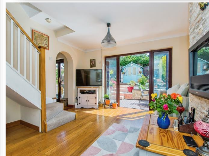
Bell Cottage Fen Street, Stilton Peterborough PE7 3RJ