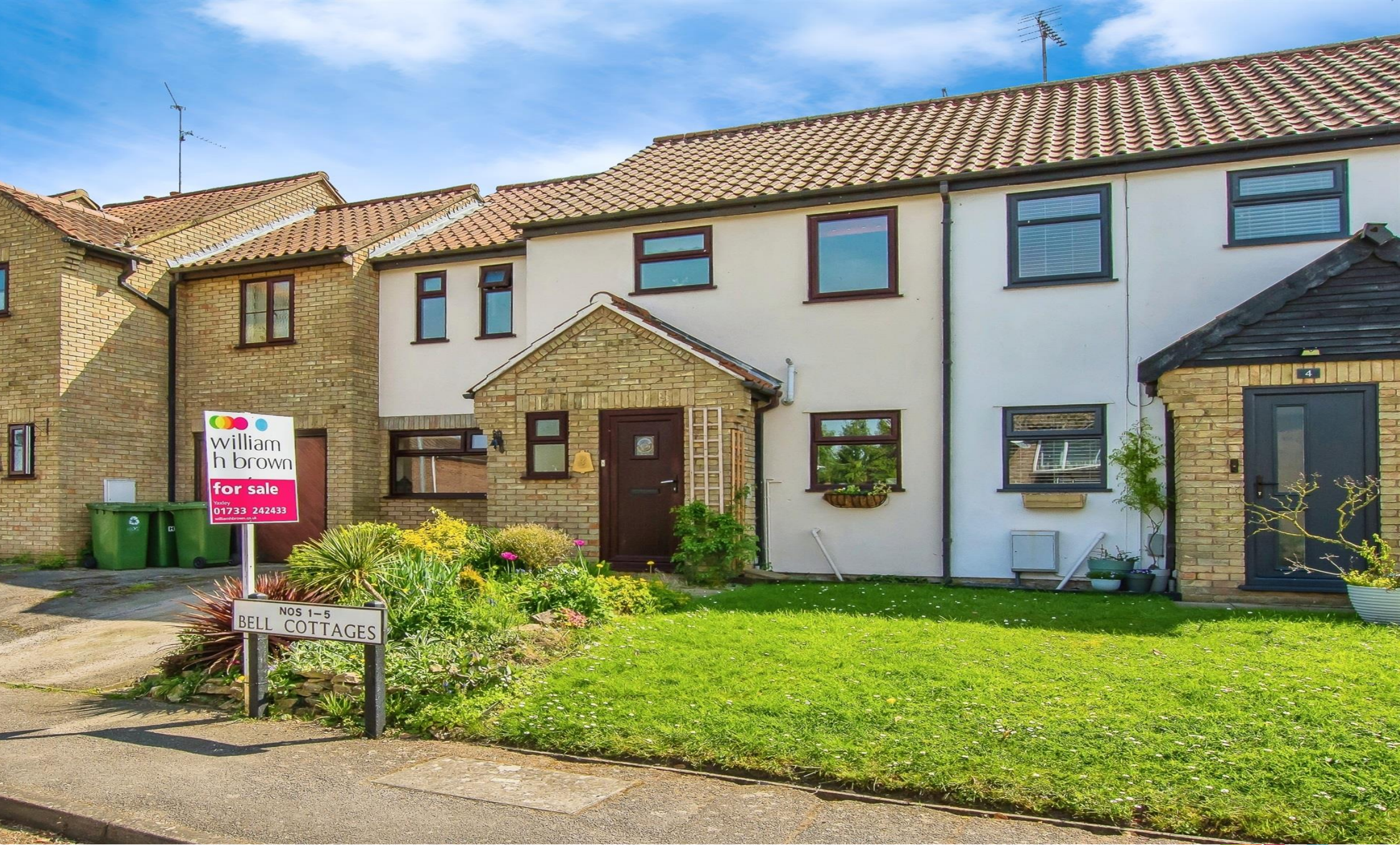
Bell Cottage Fen Street, Stilton Peterborough PE7 3RJ