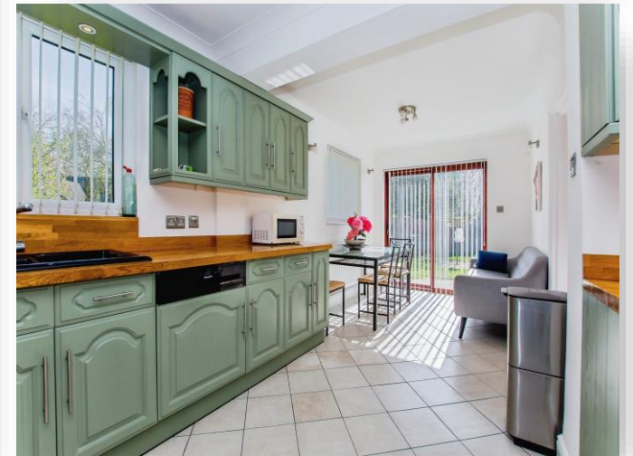
Mendys Ker 10b Fen Street, Stilton Peterborough PE7 3RJ