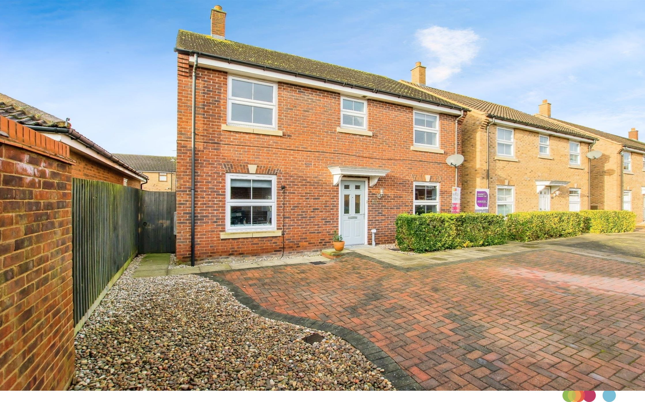
Briar Court, Yaxley Peterborough PE7 3GL