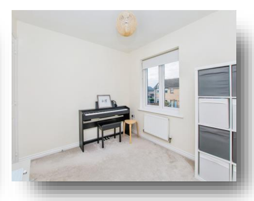
Sing and Play Peterborough Tolet Way Map data @2025