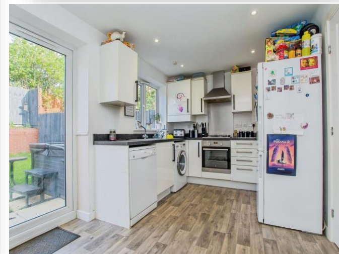
Whitney Drive, Yaxley Peterborough PE7 3EF