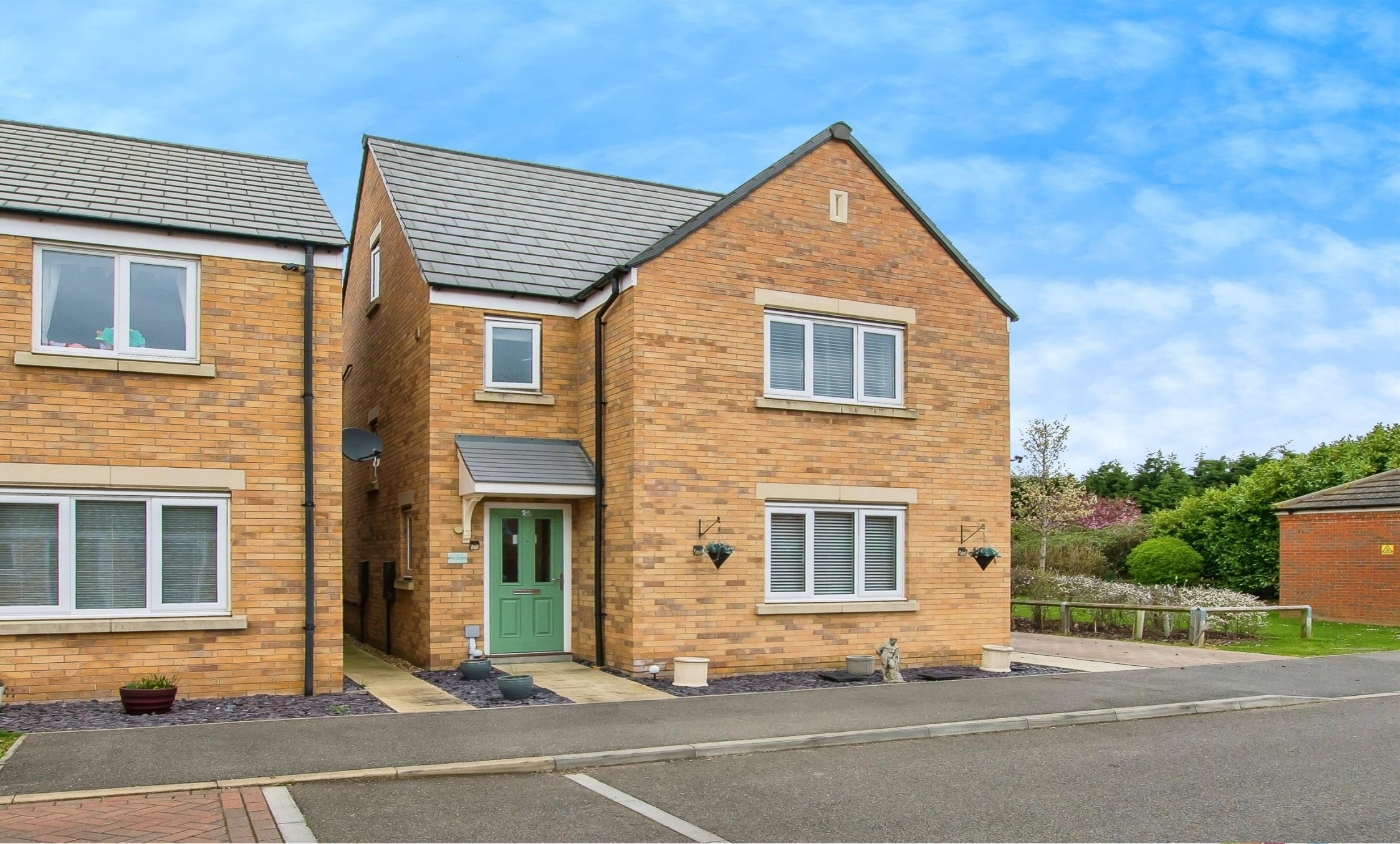
Cornmill Close, Farcet Peterborough PE7 3FT