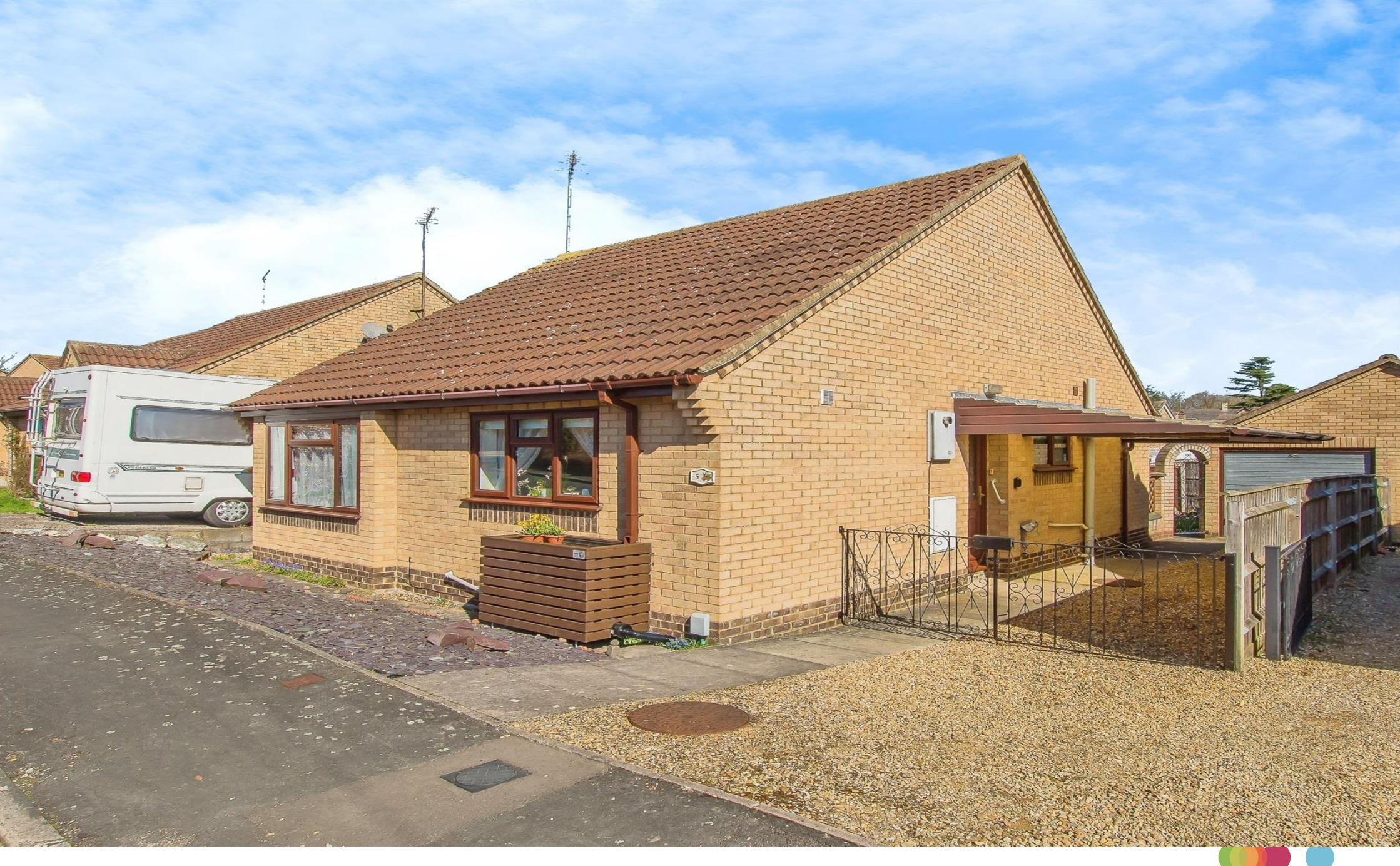
Field Rise, Yaxley Peterborough PE7 3YT